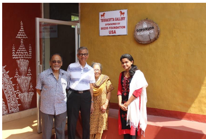
SEEDS wing at Odisha Art Center, Barkul