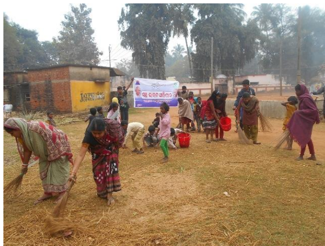
"Love India, Clean India" – MSS Village Activity