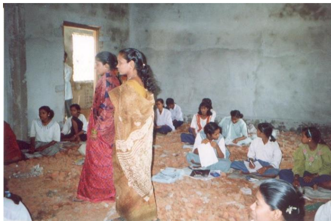
Primary/ Middle school at Galadhai village.