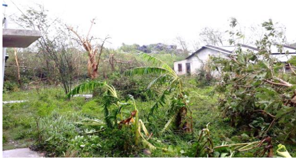
Damaged campus of ARTRC in recent cyclone.

passage through college. He was also the main coordinator for the Foundation for Excellence (FFE) scholarships administered in Odisha. This required diligent work creating a network of volunteers to find suitable candidates, checking their credentials, assisting with applications and disbursing the scholarships etc. That process has set up a very