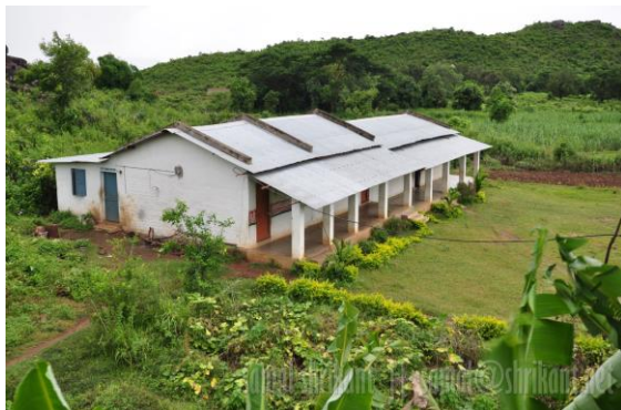
AID Rural Technology Resource Center (ARTRC) at Ranadevi village near Paralakhemundi

It feels like it has been a long long time now when almost 30 years ago, I distinctly remember reading the news of distress from the infamous Kalahandi-Balangir region of Odisha. It was widely reported internationally including in the student newspaper of the University of Michigan