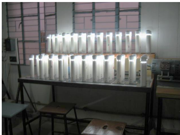
Solar Lamps as Sustainable Energy Source