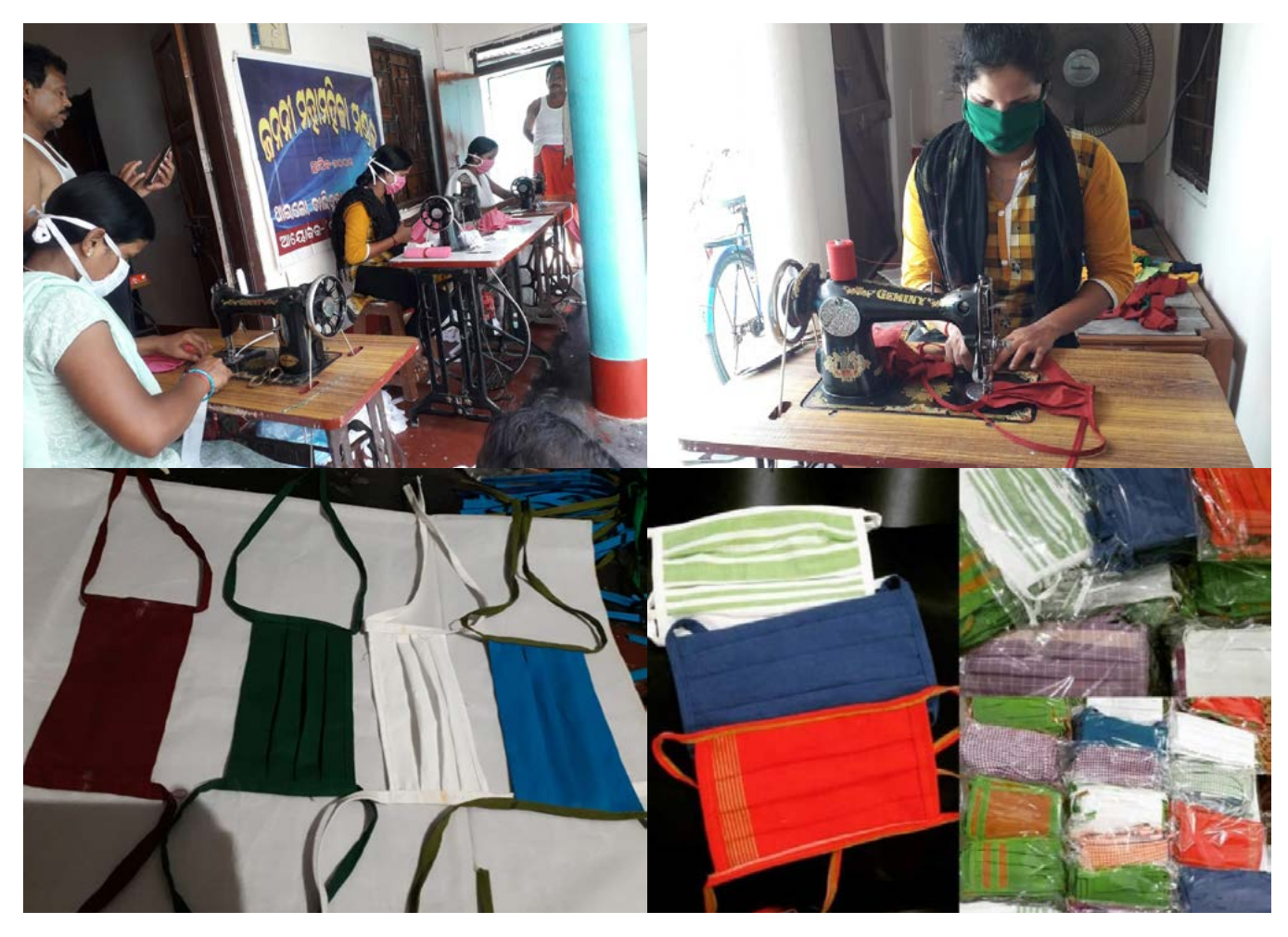
Mask stitching, and samples